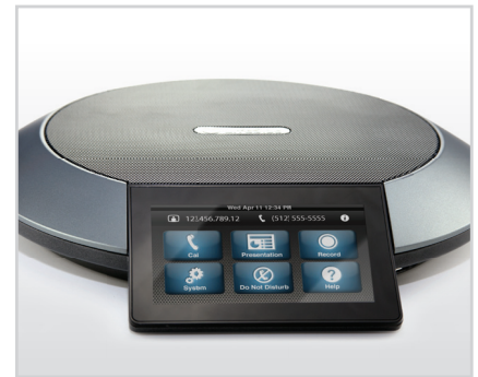
Includes LifeSize® Phone™