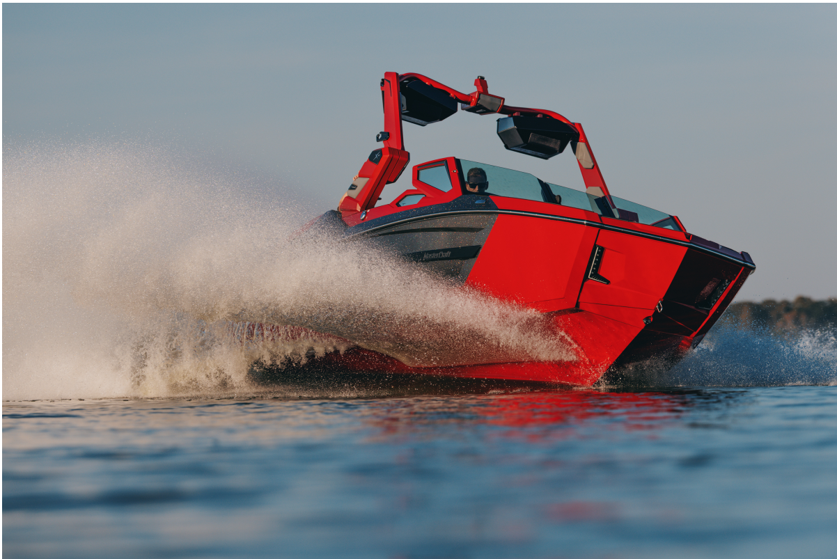
The all-new 2026 MasterCraft X22 delivers refined performance and precision as part of a ground-up redesign of the brand's 22-foot luxury towboat platform.

Every detail in the X22 is meticulously crafted, every system thoughtfully integrated, and every ride designed to deliver an experience that elevates expectations for a 22-foot premium towboat.