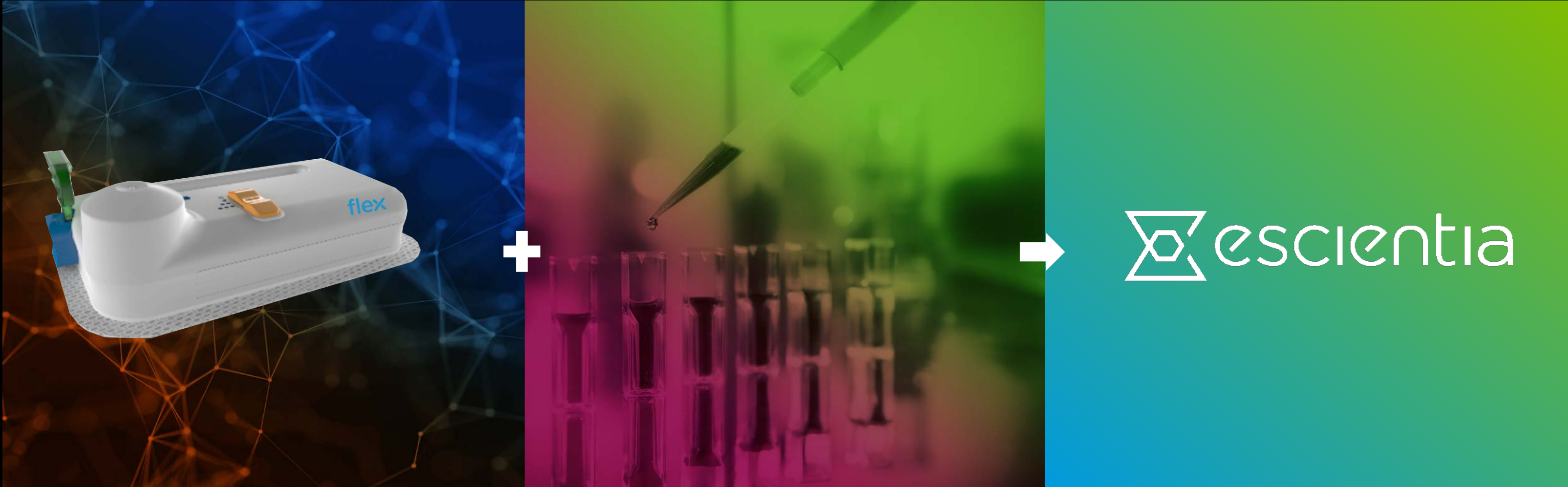
Partnership in Drug Delivery